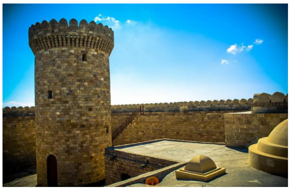
15:00 Excursion to the ethnographic reserve «Gala»